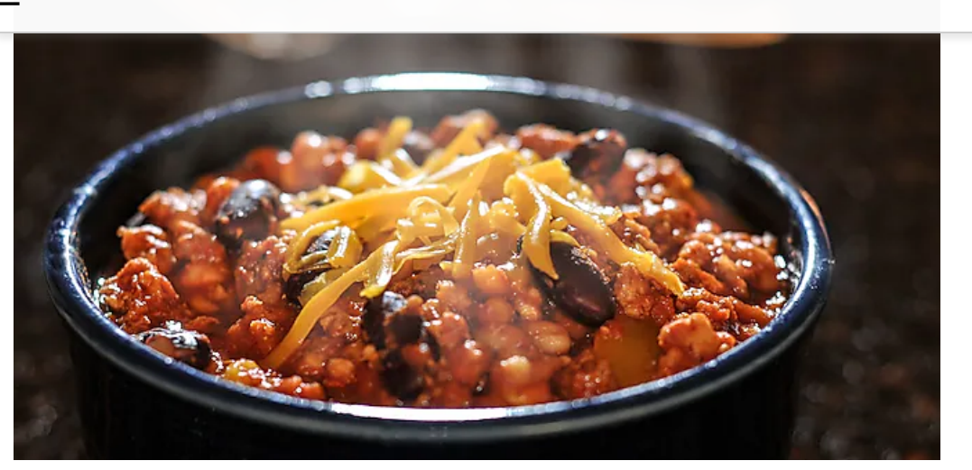
By Northside Hospital Careers